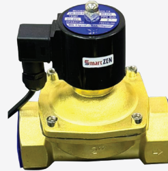
SMARTZEN 1 1/4" SOLENOID VALVE BRASS N/C24V, PMAX;0-10BAR