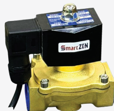
SMARTZEN 3/4" SOLENOID VALVE BRASS N/C24V, PMAX;0-10BAR