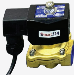
SMARTZEN 2" SOLENOID VALVE BRASS N/C 24V, PMAX;0-10BAR