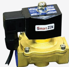
SMARTZEN 1" SOLENOID VALVE BRASS N/C 24V, PMAX;0-10BAR