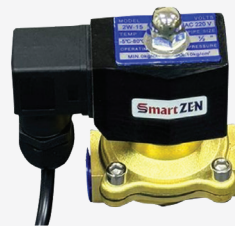
SMARTZEN 3/4" SOLENOID VALVE BRASS N/C220V, PMAX;0-8BAR