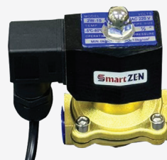
SMARTZEN 1/2" SOLENOID VALVE BRASS N/C 220V, PMAX;0-8BAR